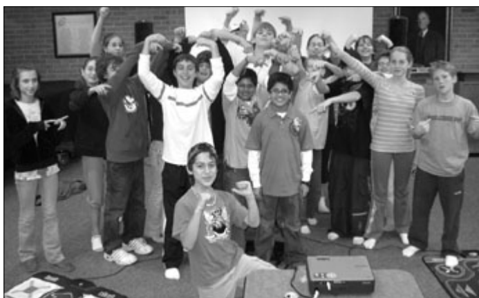
Participants pointing to the winners of the DDR Tournament,

We have booked the Avon Golf Club on October 17, 2008 for this event.