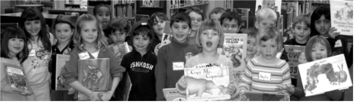
Pine Grove Kindergarteners show books they have just checked with their brand-new library cards. Kindergarteners from both elementary schools visited the library in December to get their own library cards and a special storytime.

Our polar bear winter reading club, "CHILL OUT AND READ," is underway. Sign up and get your reading log. Weekly raffle winners. Prizes and party on March 7. All ages. Stay motivated and warm!