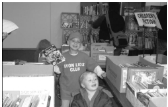
Book Sale Shoppers