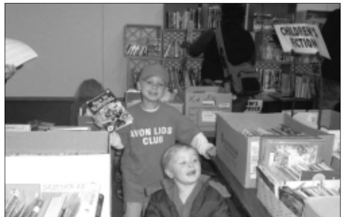
Book Sale Shoppers