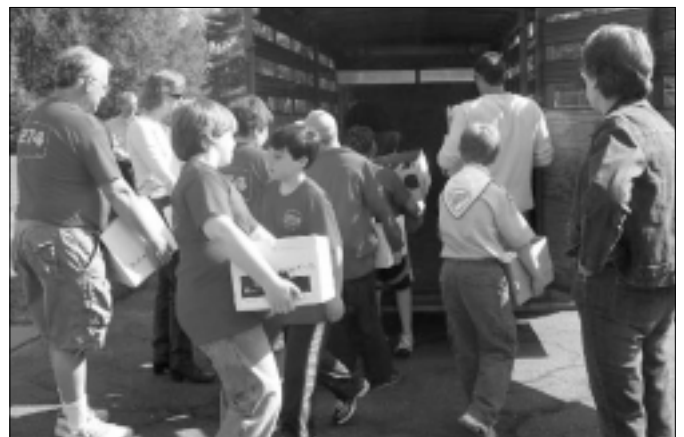
Thank you to Boy Scout Troop 274!