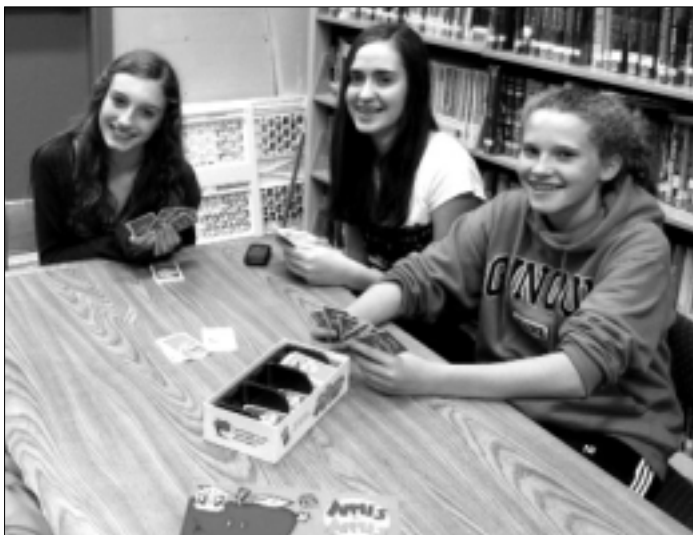
Welcome Back Teen Fridays!!

You need an Amazon account to use the Kindle feature. A valid library card from a participating library is also required.