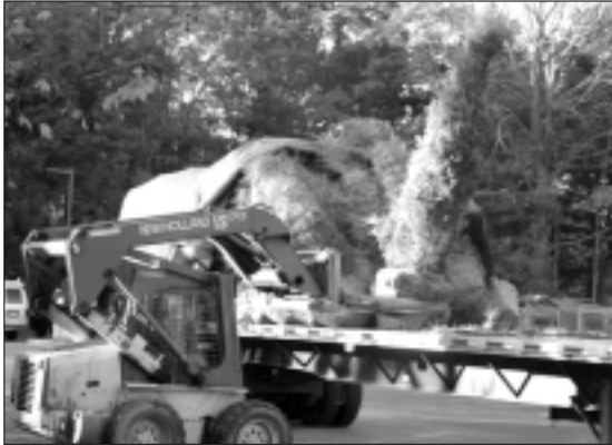
The trees arrive!

(Halloween to Thanksgiving, or as soon as we can open.)