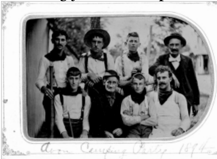
"Avon Camping Party, 1894" Avon residents have always hit the road during the summer.