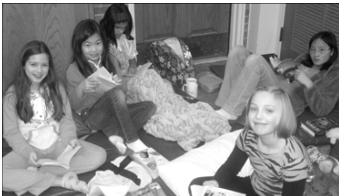
Readers Theater Princess Buffet