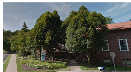
Avon Town Hall 60 West Main St.