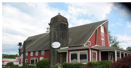
Riverdale Farms Silo 136 Simsbury Rd.