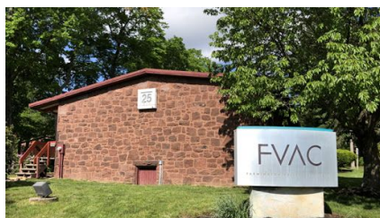
Farmington Valley Arts Center 25 Arts Center Ln.