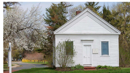
The Living Museum, Historical Society 8 East Main St.