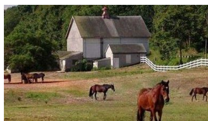
First Company Governor's Horse Guard 280 Arch Rd.