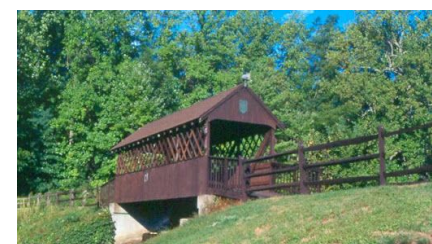
Covered Bridge at Countryside Park 355 Huckleberry Hill Rd.