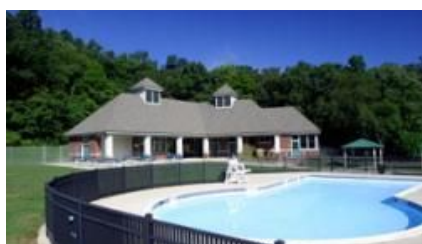
Sycamore Hills Pool 635 West Avon Rd.