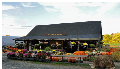
The Pickin' Patch 219 Nod Rd.