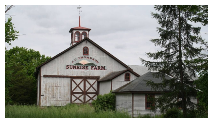
Sunrise Farm 712 West Avon Rd.