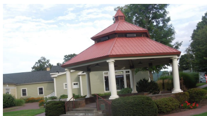
Avon Town Green Gazebo West Main St. x Ensign Dr.