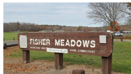
Fisher Meadows Parks 800 Old Farms Rd.