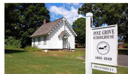
Pine Grove Schoolhouse 3 Harris Rd.