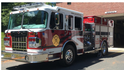
Fire Department 25 Darling Dr.