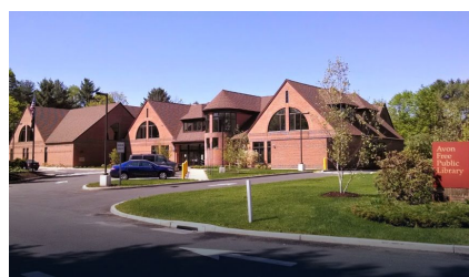
Avon Free Public Library 281 Country Club Rd.