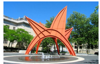
"Stegosaurus" by Alexander Calder Hartford City Hall 550 Main St., Hartford