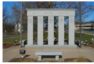
"Veterans Memorial" Farmington Veterans Memorial Committee Farmington Town Hall