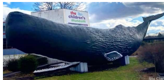
"Conny the Whale" The Children's Museum by volunteers from The Cetacean Society 950 Trout Brook Dr. West Hartford