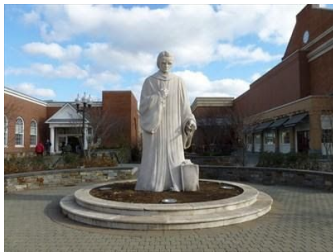
"Noah Webster Statue" by Korczak Ziolkowski Blue-Back Square 20 South Main St. West Hartford