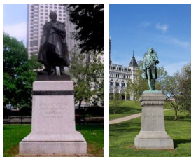
"Horace Wells" by T. H. Bartlett & "Israel Putnam" by John Quincy Adams Ward Bushnell Park (some walking required) 99 Trinity St., Hartford