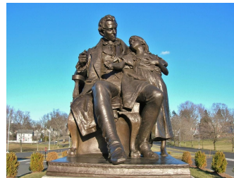
"Thomas Hopkins Gallaudet" by Daniel Chester French American School for the Deaf 139 North Main St. West Hartford