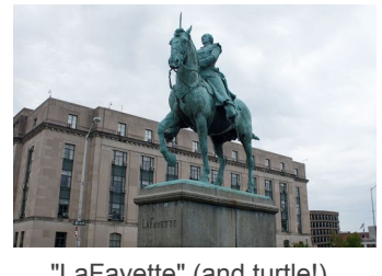
"LaFayette" (and turtle!) by Paul Wayland Bartlett Connecticut State Capitol 231 Capitol Ave. Hartford